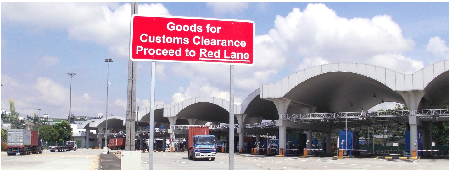
Before they reach the Pasir Panjang Terminal in-gate to move cargo into the free trade zone, prime-mover drivers are reminded to drive to the Red Lane for their goods to be cleared.