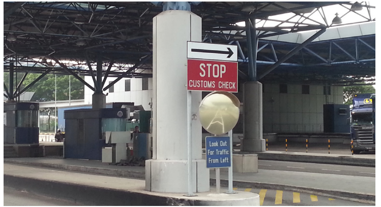
The new sign at Changi Airfreight Centre directs drivers to the designated lane for customs clearance of their goods.

In addition, Singapore Customs also briefs new prime-mover drivers on customs procedures twice a month, as part of an initiative with PSA Corporation. The agency aims to strengthen self-compliance of customs regulations among traders with these measures.