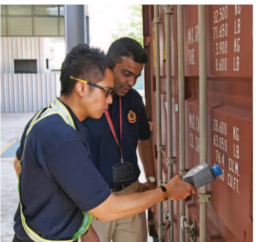
More than 50 Singapore Customs officers went through extensive training in image analysis and cargo inspection before taking on new export scanning duties.