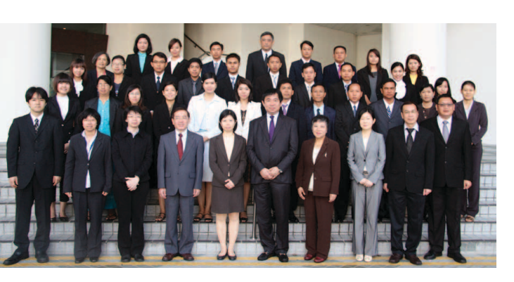
Singapore Customs, together with Japan Customs, conducted courses on national single window for ASEAN customs officials (right) and trade facilitation for 30 Myanmar customs and trade officials (above).

In addition, experts from Japan Customs highlighted the importance of classification in customs modernisation and the implementation of the HS Convention in Japan. The course was useful to the officials, especially at a time when Myanmar is undergoing rapid development.