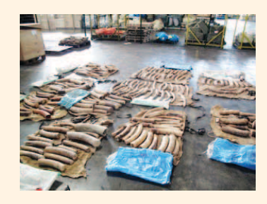
Singapore Customs and the AVA intercepted an illegal shipment of about 1.8 tonnes of raw ivory tusks smuggled from Africa.

or imprisonment of up to two years. The same penalties apply to any transhipment of ivory through Singapore without proper CITES permits from the exporting/importing country.