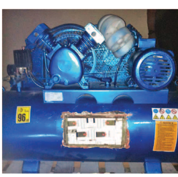
Contraband cigarettes were hidden in air compressors.