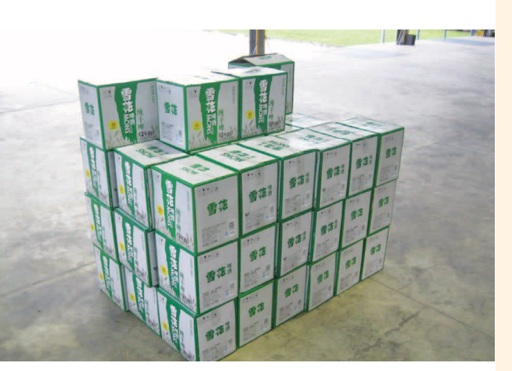
Singapore Customs seized more than 32,000 bottles of duty-unpaid Snow beer hidden among consignments of soft drinks from China.

Under the Customs Act, it is the responsibility of every importer and exporter of dutiable goods, or their agent, to keep documents and recordings relating to the goods. With effect from 1 March 2007, the retention period was reduced from seven to five years. The same record retention requirement also applies to imported goods subject to payment of Goods and Services Tax (GST).