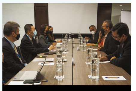
Bilateral meeting with Indonesia's Directorate General of Customs and Excise (right).