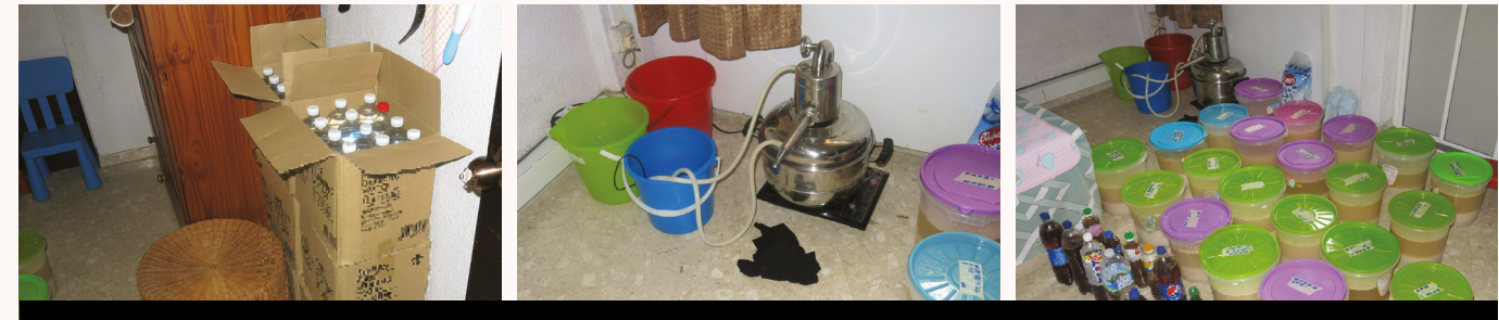
74 bottles of homemade rice wine, a still, plastic containers containing fermented liquor contents and bottles of yeast powder found in a unit.

On 20 March 2021, Singapore Customs officers inspected an HDB unit near Lorong Ah Soo and found 74 bottles of homemade rice wine totalling about 83 litres, a still for distilling rice wine, plastic containers containing fermented liquor contents and bottles of yeast powder.