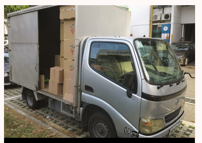
Duty-unpaid cigarettes found in brown boxes in the truck's cargo compartment.

Investigations revealed that the man was offered a delivery job by an unknown person via a social media platform to deliver boxes said to contain soaps, where he would be paid $120 for every four boxes delivered.