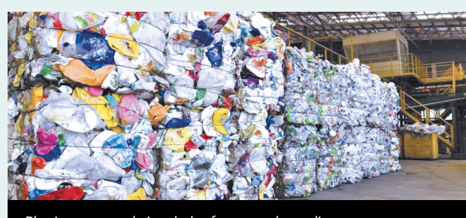
Plastic waste made into bales for onward recycling.

export and transit of plastic waste will be put into force on 1 October 2020, before the effective date of 1 January 2021 by the Basel Convention.