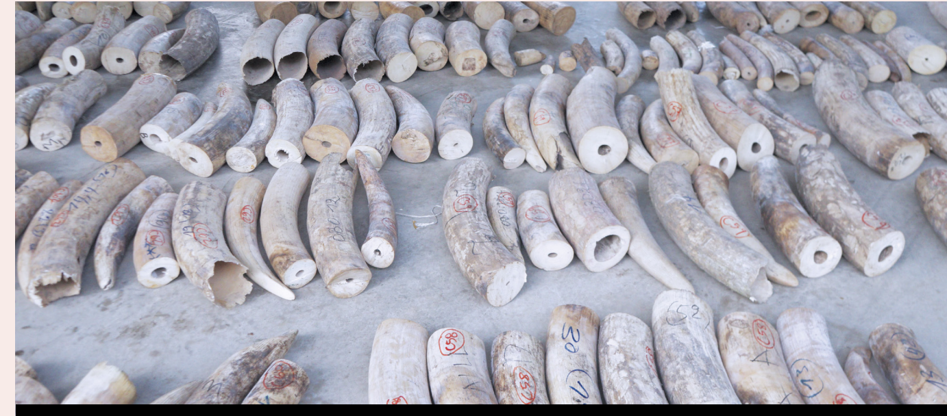
he largest seizure of elephant ivory in Singapore to date.