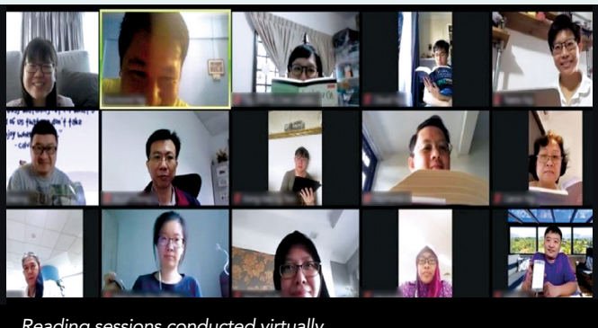
Reading sessions conducted virtually