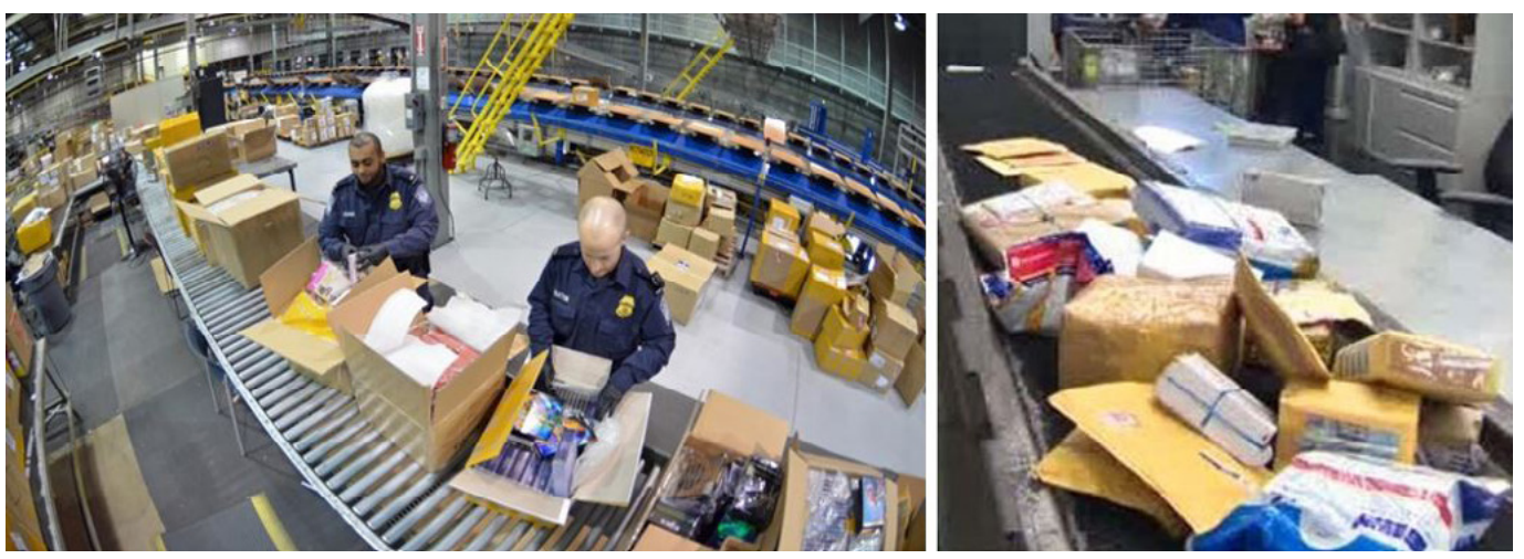
Case 4b: Inspection conducted at the Miami International Mail Facility.