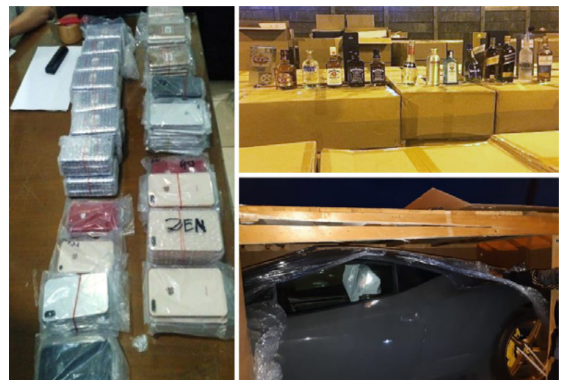
Case 1: Goods seized by DGCE

On 24 August 2018, under the auspices of Regional Intelligence Liaison Office Asia Pacific's Project Crocodile, Singapore Customs alerted the Australian Border Force (ABF) to a suspicious cigarette shipment that was headed for Melbourne, Australia. The alert led to the ABF successfully seizing the shipment of 10.2 million sticks of cigarettes, which were falsely declared as instant noodles.