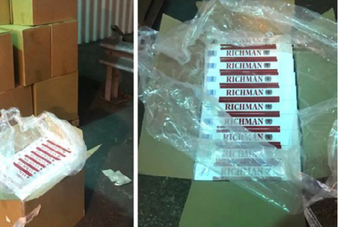
Case 3: Smugaled cigarettes seized at Belfast Port, (Photo: Border Force Northern Ireland,