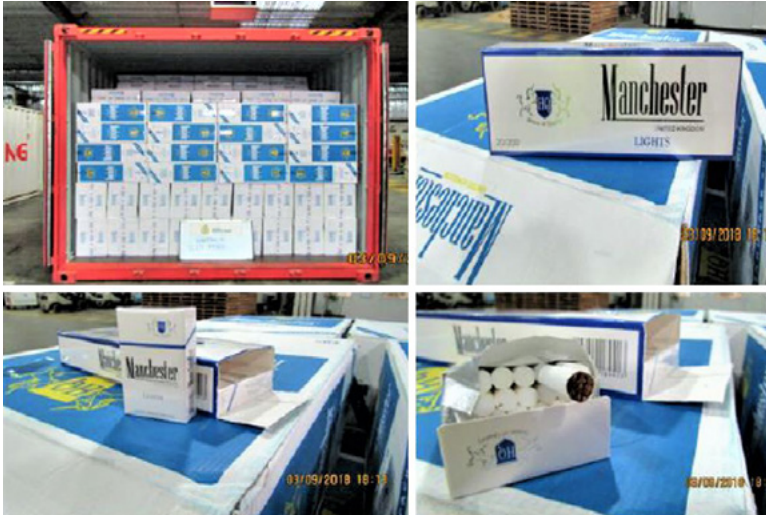
Case 2: Cigarettes seized by ABF

Acting on alerts provided by Singapore Customs, DGCE conducted five enforcement operations two targeting the illegal importation of liquor by sea, and three targeting the attempted smuggling of mobile phones by airplane passengers. From the five operations, a total of about 86,000 bottles of liquor, a luxury car, and 2,014 mobile phones were seized