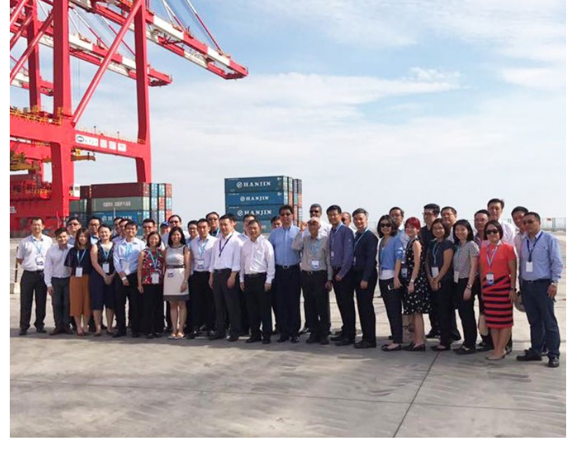
Representatives from 15 government agencies, port operators and universities visited the Port of Shanghai, Yangshan Terminal Phase 4, to learn more about the automation of port operations.

A delegation of 39 representatives from 15 government agencies, port operators and universities embarked on a five-day study visit in Japan and China in July 2017. They visited several ports to gain insights into port master planning, technologies and operations to help shape the development plans of the Tuas Port.