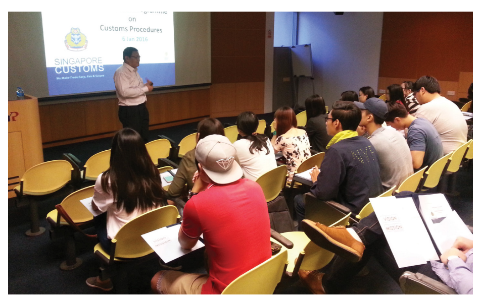
Nanyang Polytechnic students attend a lecture as part of the customised programme conducted by Singapore Customs.

Launched in 2012, SCA is Singapore's dedicated public institution providing specialised courses on customs matters primarily to the business community.