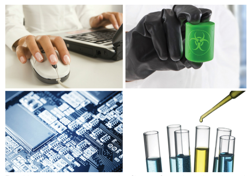
The training programme covered areas such as Singapore Customs' strategic goods control systems, general radiation training, handling of chemicals, and permit and cargo clearance.

Knowledge development and learning are integral parts of how Singapore Customs nurtures its officers. Recently, two new in-house programmes were introduced – one for officers who perform sea export inspections, and the other for Tourist Refund Scheme (TRS) officers.