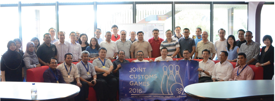
Participants cheered for each other, mingled, and gave it their all during the Joint Customs Games. After two games, the results for the top bowler, bowler with most number of strikes, and top three scoring teams were announced. A final group photo rounded up the Games.