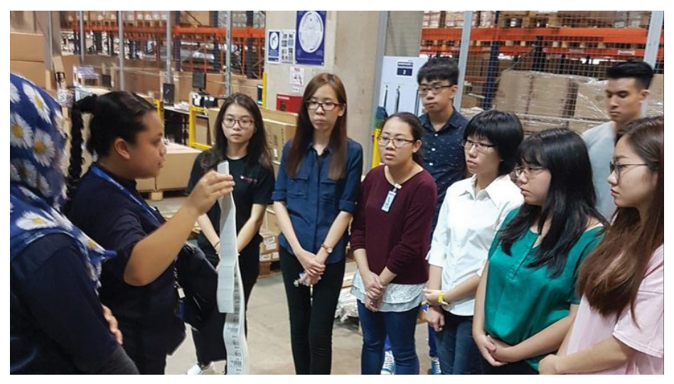
Temasek Polytechnic students visit a warehouse licensed by Singapore Customs.