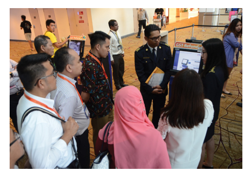
Participants observed how technology helps to provide travellers with a seamless and fast service experience for tax refunds and payments at Changi Airport.

This year's JCMMP ended on 18 August 2016 with a fireside chat between the programme participants and the heads of the four customs administrations. During the dialogue, there was a candid exchange of views on issues close to the hearts of the participants.