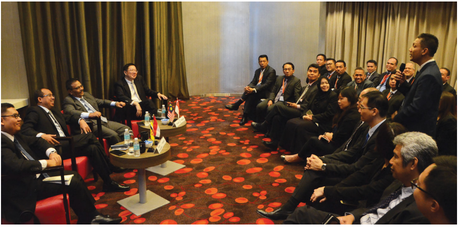
A candid exchange of views between the heads of the four customs administrations and the programme participants took place during the fireside chat on the final day of the programme.