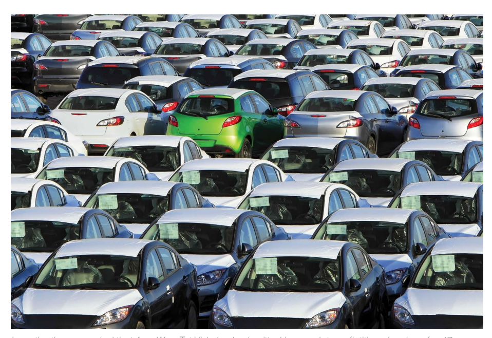
Investigations revealed that Ang Wee Tat Vida had submitted incomplete or fictitious invoices for 47 imported cars to Singapore Customs for the assessment of duty and Goods and Services Tax (GST) payable, between January 2012 and June 2013.

Between January 2012 and June 2013, Ang submitted to Singapore Customs incomplete or fictitious invoices for 47 imported cars.