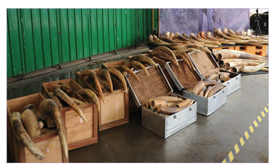
The display of seized elephant ivory at the ivory crush event was just a small fraction of the 7.9 tonnes that was destroyed.

Senior Minister of State of National Development and Home Affairs Desmond Lee, who witnessed the crushing, said: "The public destruction of ivory sends a strong message that Singapore condemns illegal wildlife trade. By crushing the ivory, we ensure that it does not re-enter the ivory market. Tackling this illicit trade requires close international cooperation, and also the assistance of the public and NGOs. We will continue our enforcement efforts, to prevent Singapore from being used as a transit point."