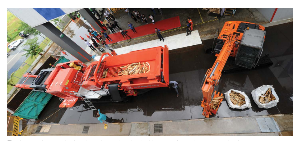
The ivory tusks were broken into pieces then loaded into a rock crusher and crushed.