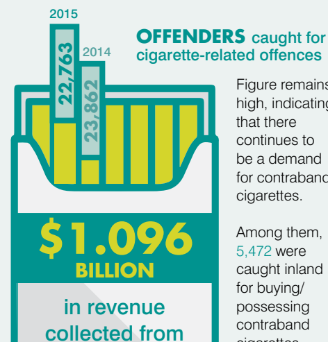
Figure remains high, indicating that there continues to be a demand for contraband cigarettes.

Among them, 5,472 were caught inland for buvina/ possessing contraband cigarettes.