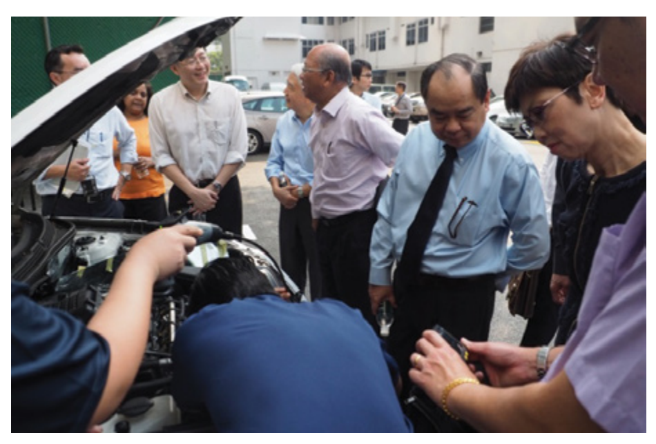
Customs Advisory Council members observing Singapore Customs officers demonstrate the use of a borescope, a device used to detect contraband cigarettes concealed in "secret" compartments in a modified vehicle.

Customs Advisory Council (CAC) members visited the Customs Operation Command, Pasir Panjang Export Inspection Station, and PSA's Pasir Panjang Terminal.