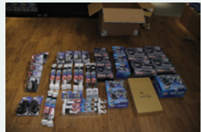
Motorcycle accessories found on the premises of C&C Moto Factory LLP.

create fictitious invoices with suppressed values. He submitted his import declarations to Singapore Customs based on the suppressed values stated in those invoices.