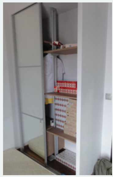
Duty-unpaid cigarettes, which were smuggled into Singapore through air courier consignments, were recovered from the private apartment in Geylang East Avenue 2.

A total of 1,168 cartons and 400 packets of duty-unpaid cigarettes were seized in this operation. The amount of duty and GST evaded exceeded $102,000. Liu, Huang, Li