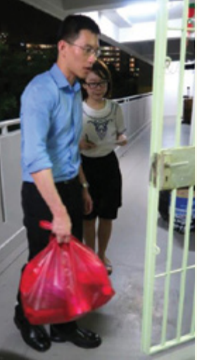
Singapore Customs volunteers packed food goodie bags for distribution to needy families in Ang Mo Kio.