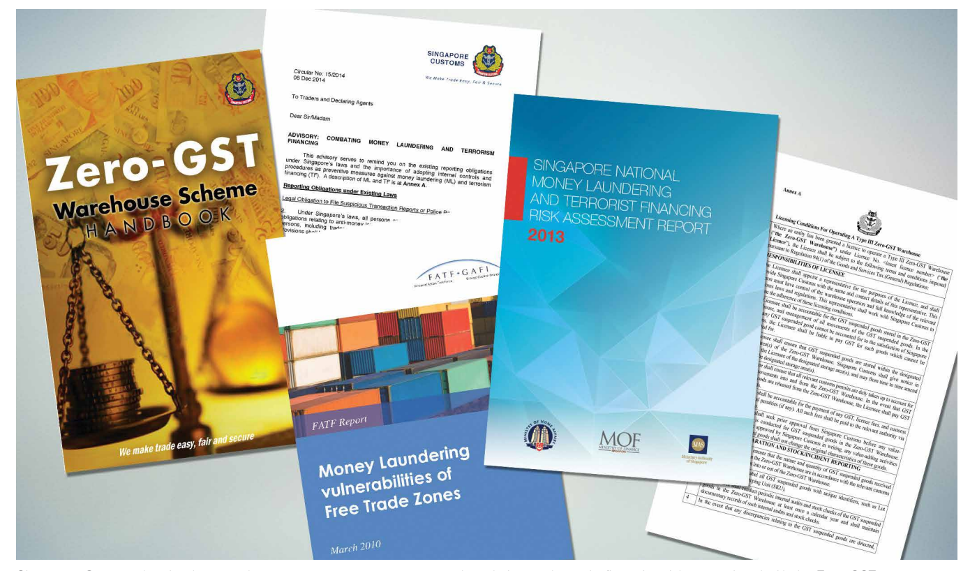
Singapore Customs has implemented new measures to counter money laundering and terrorist financing risks associated with the Zero-GST Warehouse Scheme.

Based on international typologies, the four categories of goods were identified to be more vulnerable to money laundering and terrorist financing risks due to their high value and relative ease of being carried around. With the list of goods narrowed down, Singapore Customs began an extensive series of consultations to better understand industry practices as well as the business needs of the licensees. With the support of the licensees, Singapore Customs was able to implement the risk-mitigating measures in the revised zero-GST licensing conditions.