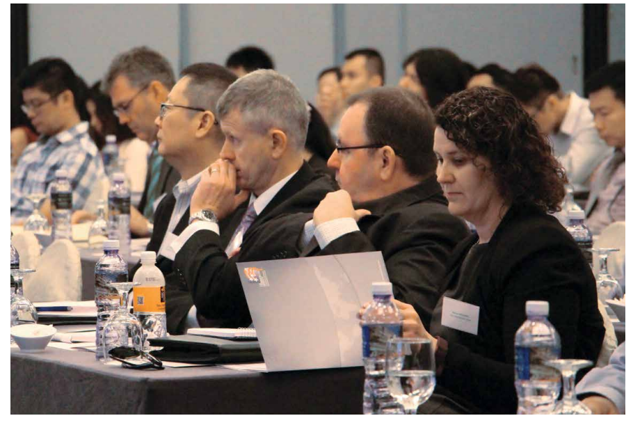
Experts from regulatory agencies and the private sector shared best practices on strengthening internal compliance measures, and case studies on trade compliance with the freight forwarding and logistics industry at a seminar on Strategic Trade Management on 2 September 2015.

A seminar on strategic trade management was held for the freight forwarding and logistics industry in Singapore on 2 September 2015 at the Concorde Hotel. The event was jointly organised by the United States Bureau of Industry and Security and the United States Export Control and Related Border Security, with support from Singapore Customs.