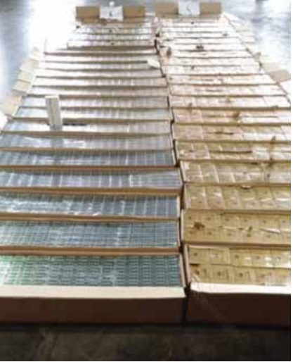
Operation in Jurong Port: Assorted brands of duty-unpaid cigarettes were hidden within a consignment of remote controlled toy cars.

Information can be provided through the Singapore Customs hotline at 1800-233-0000, or by emailing customs_intelligence@customs.gov.sg. All information received will be treated in strict confidence.