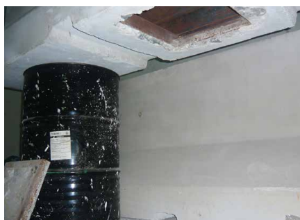
The duty-unpaid cigarettes were concealed in hollow spaces within the blocks of concrete barriers.