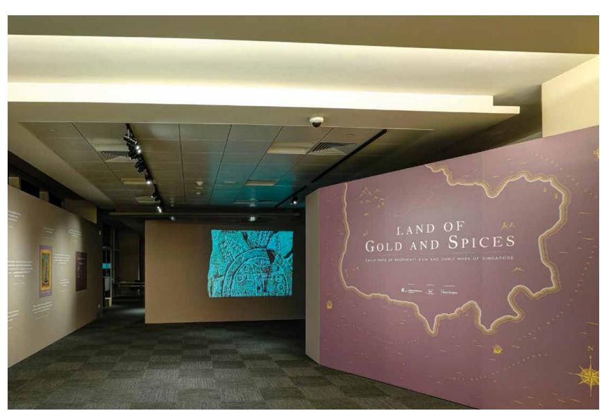
The exhibitions underscore how maps have played a critical role in the development of the region. Notably, 16 pieces of high-value old maps from the 17th to 20th century were temporarily imported for the showcase.