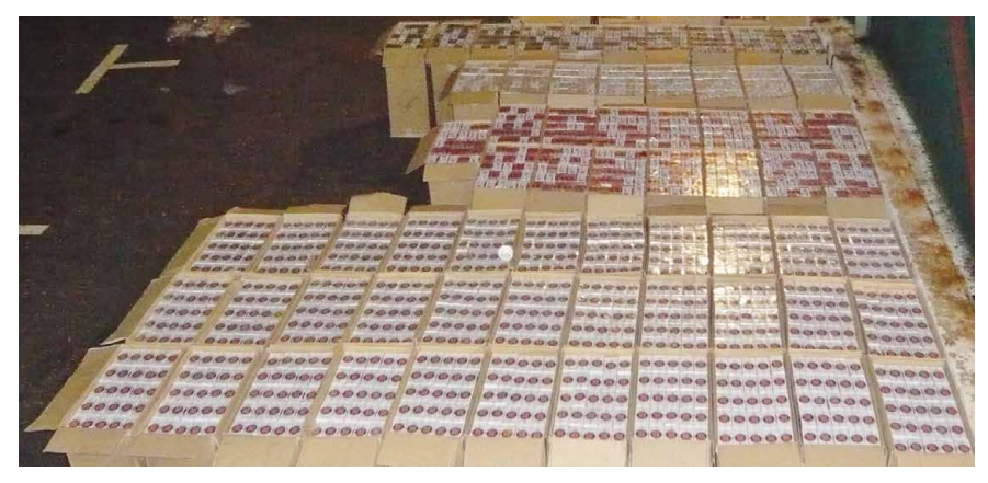
A total of 3,700 cartons of duty-unpaid cigarettes were seized in this operation.