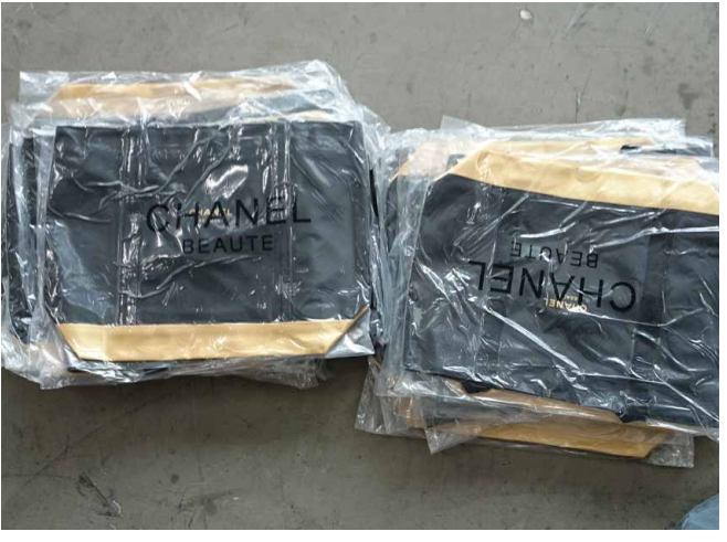
20 counterfeit bags.

Anyone with specific information on illegal trading activities can report it to Singapore Customs via email (customs intelligence@customs.gov.sg). All information received will be treated in strict confidence.