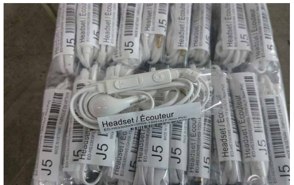
600 sets of counterfeit earphones.

uring an inspection at the importer's warehouse at Kaki Bukit Avenue, Singapore Customs enforcement officers found an assortment of mobile phone accessories, watches, sunglasses, bags, wallets suspected to be counterfeit goods of popular brands.