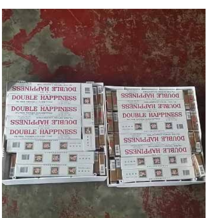
Operation in Keppel FTZ: Duty-unpaid cigarettes were found hidden within the water dispensers.