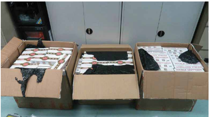
Operation in Changi FTZ: Some 300 cartons of duty-unpaid cigarettes were found hidden under mobile phone covers.

S ingapore has 10 FTZs in five geographical areas operated by three FTZ authorities.