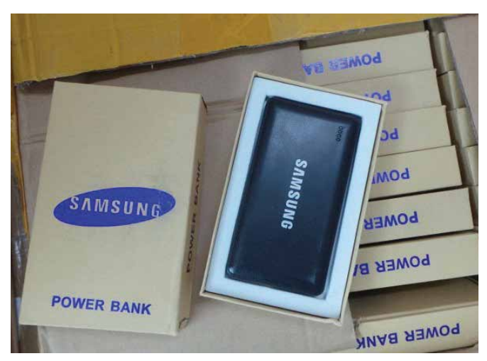
180 units of counterfeit power banks.

"Singapore Customs will take firm action against importers who bring in counterfeit goods. We will uphold our commitment to ensure a robust intellectual property rights enforcement regime in Singapore," said Mr Yeo. 6