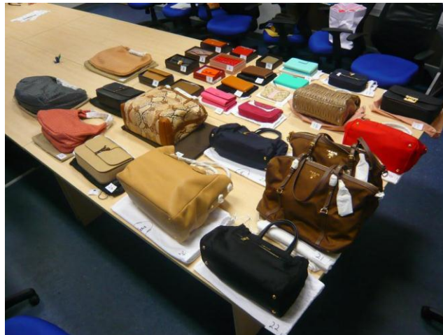
Luxury bags seized from online retailers who attempted to evade GST.

These online retailers had attempted to evade GST through methods such as using fake invoices to suppress the value of goods imported and under-declaring the value of goods on their import permits declaration. Singapore Customs will continue to keep a close watch on online retailers and clamp down on those who try to evade GST.