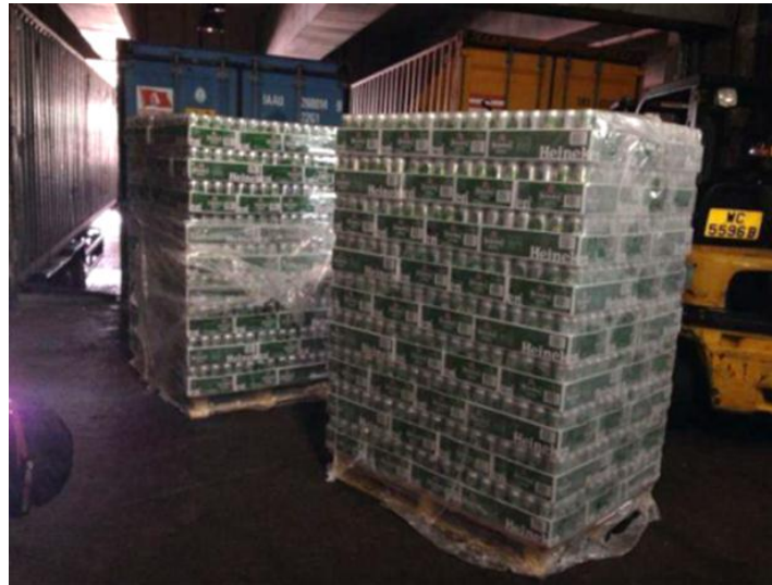
Consignment of duty-unpaid beer seized.