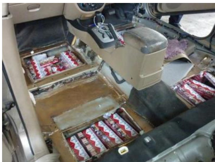
Contraband cigarettes hidden in the modified floorboard of a car.

Many of these seized vehicles had modified compartments, which were used to hide the contraband cigarettes.