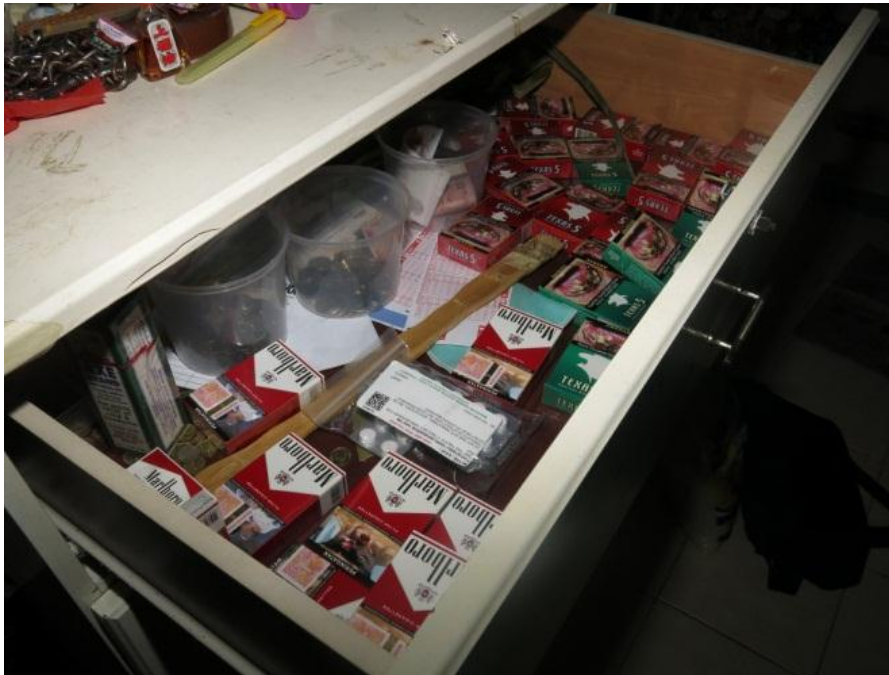
Some of the duty-unpaid cigarettes found in the HDB unit in Ang Mo Kio Avenue 4.