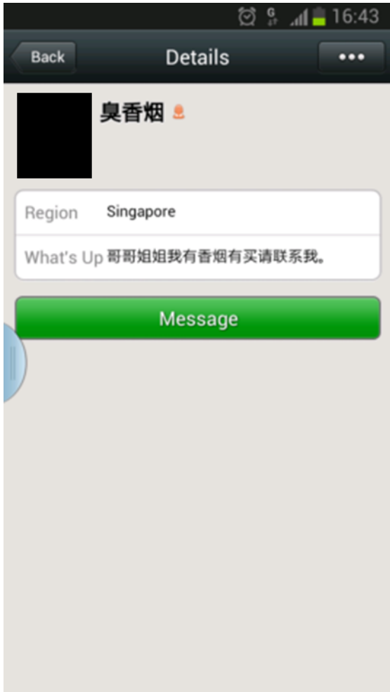
A screenshot of the instant messaging status of a peddler selling contraband cigarettes on “WeChat”.