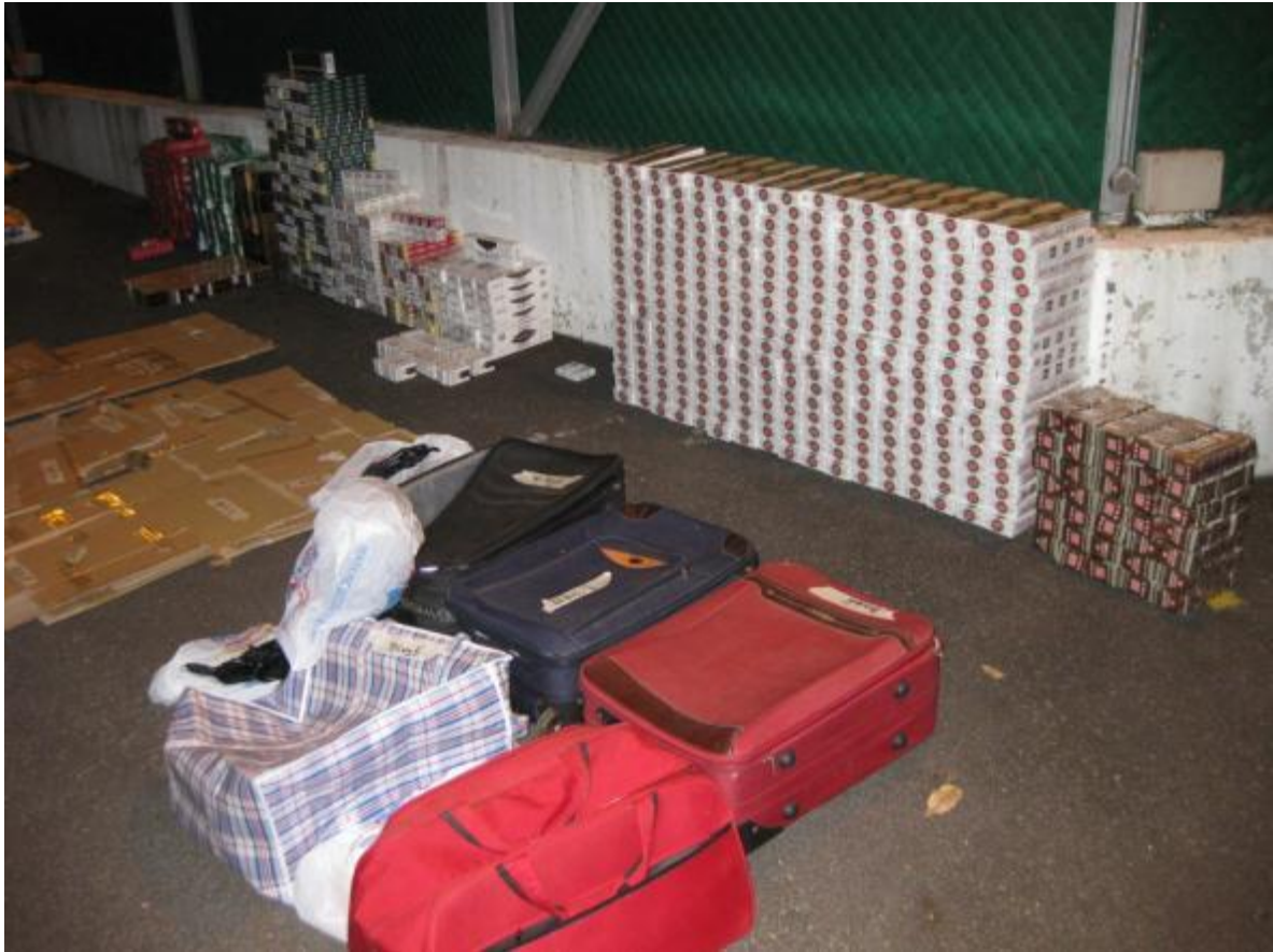
Contraband cigarettes, stored in luggage, recovered in one of the operations.