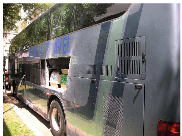
Double decker tour bus used for conveying the contraband cigarettes