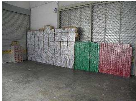
Contraband cigarettes uncovered inside the bonded trucks