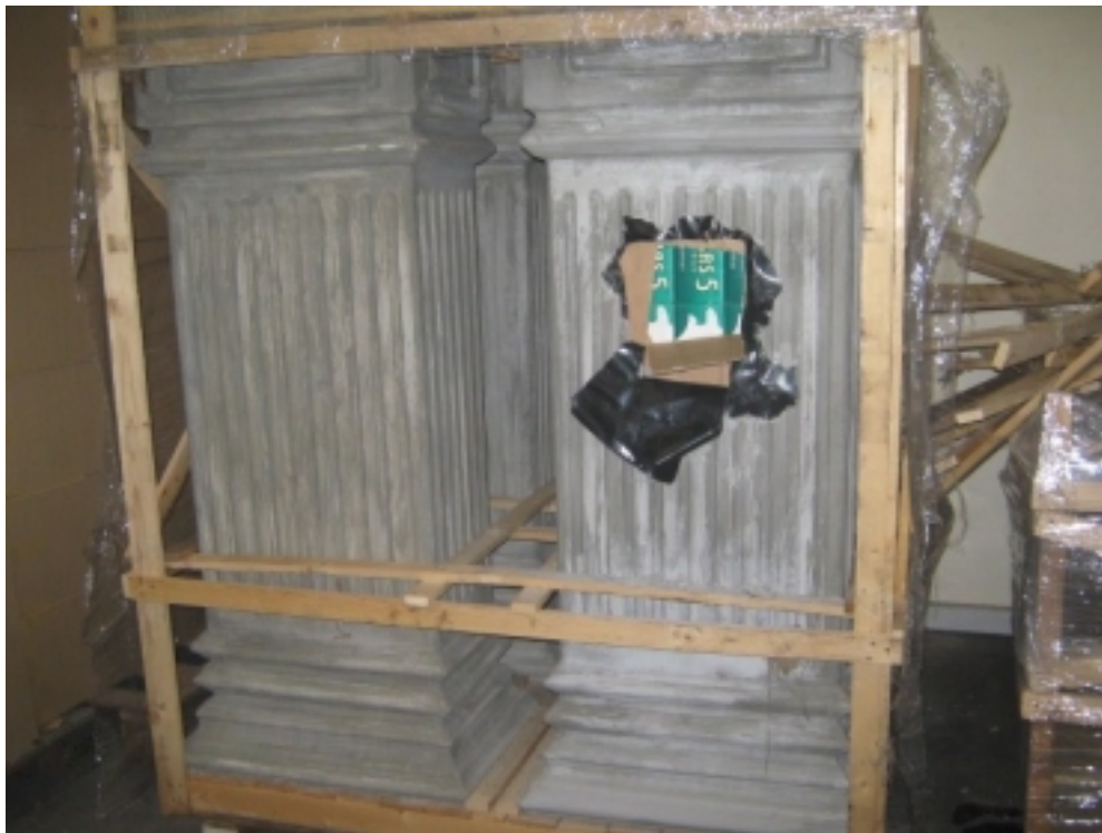
Decorative pillars concealing illegal cigarettes