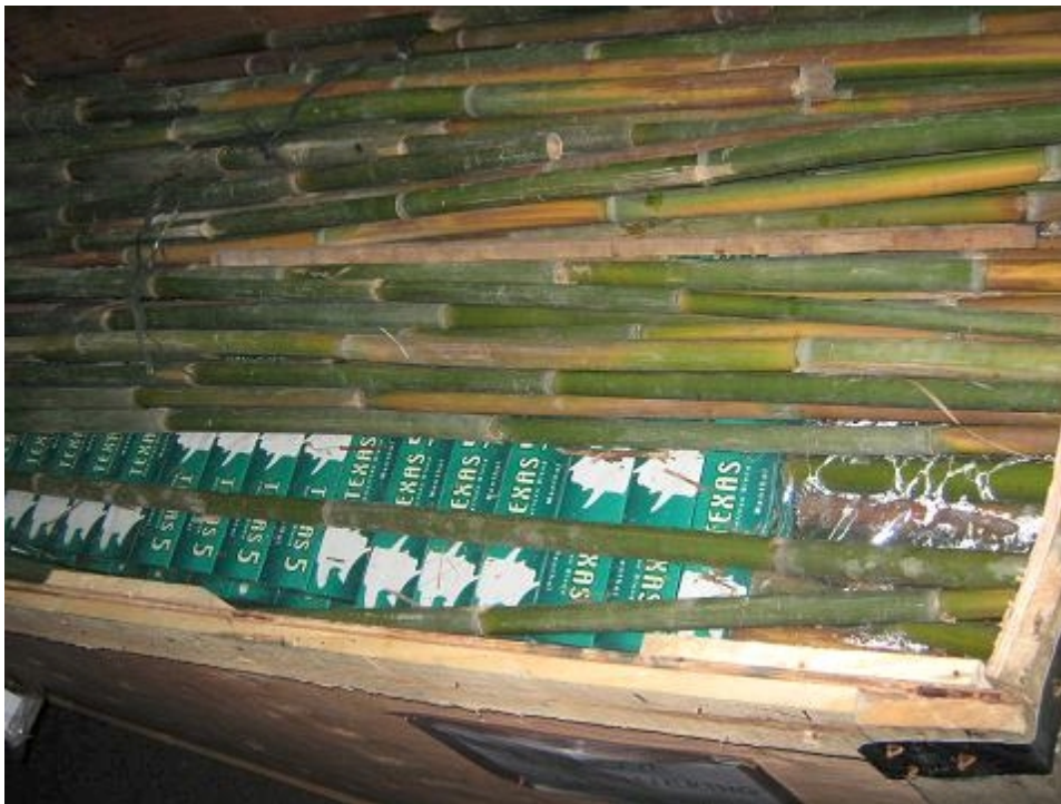
Pieces of bamboo poles were used as a cover load to conceal packets of contraband cigarettes