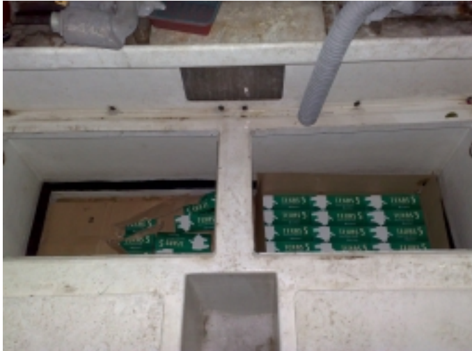
(Top and Bottom) Tanks containing live prawns were used as cover load to conceal duty-unpaid cigarettes.