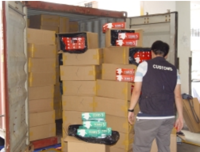
Singapore Customs seized the largest haul of illegal cigarettes in June 2008 at 233,500 packets

Singapore Customs ended 2008 on a high note as enforcement strategies have proven to be effective to control the illegal cigarette situation