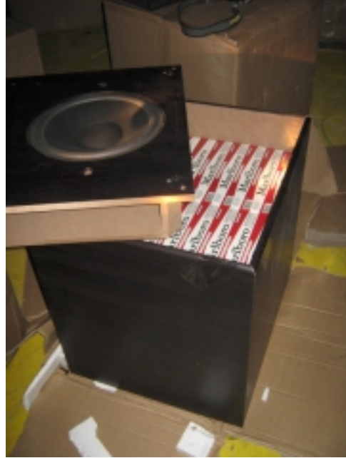
(Left) The subwoofer looks just like any audio equipment. (Right) In fact, it has been hollowed-out to hide contraband cigarettes