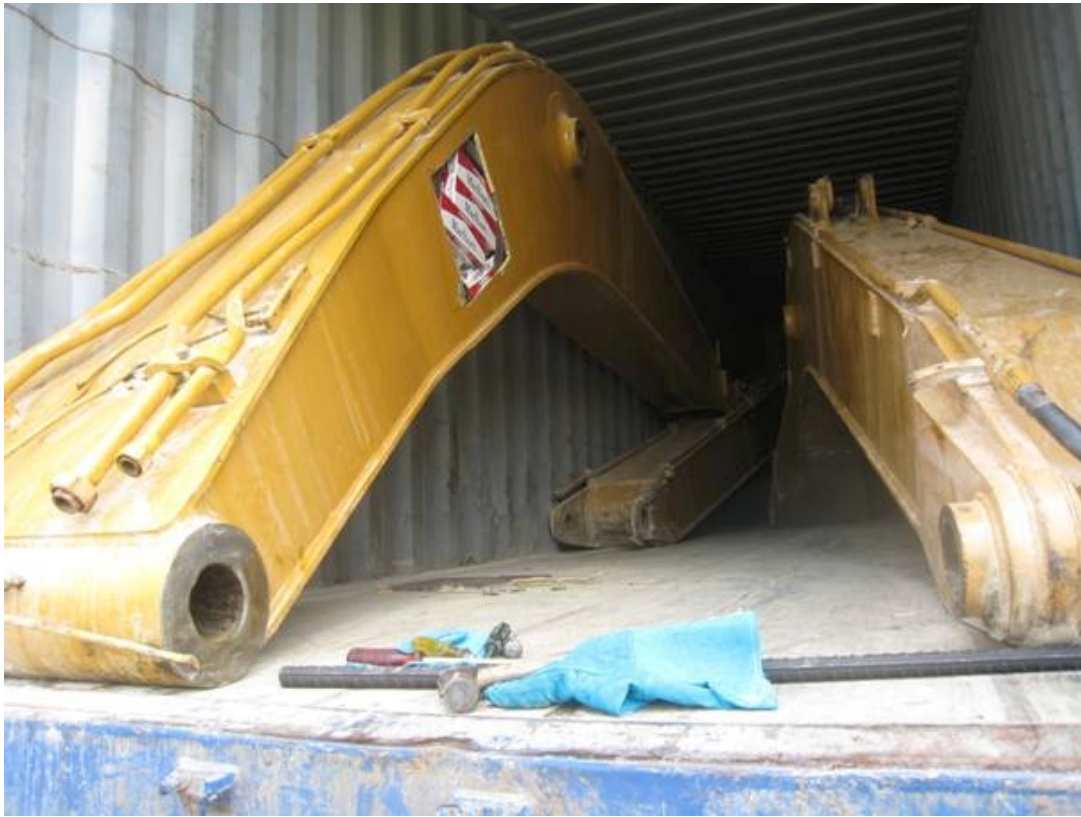
Cigarettes hidden in the arms of excavator machines