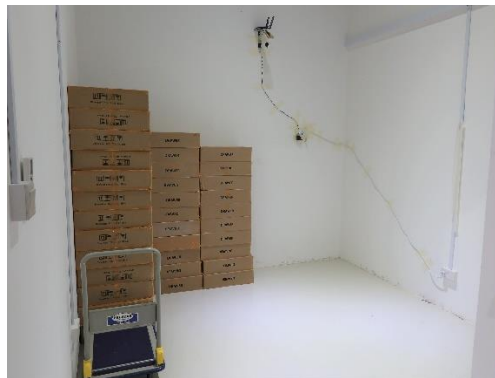
The duty-unpaid cigarettes found in an industrial unit at Senang Crescent