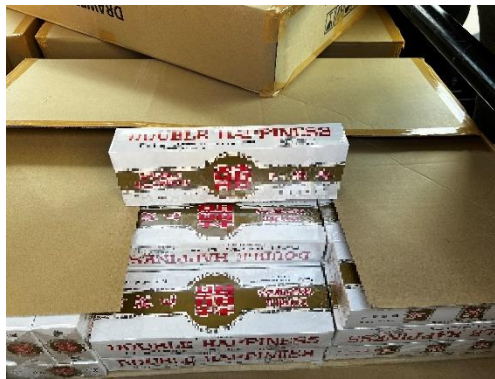
The duty-unpaid cigarettes found in the van at the carpark at Jalan Boon Lay